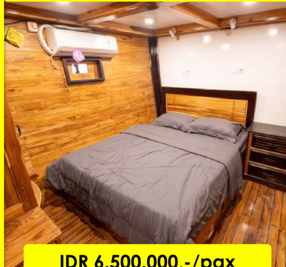
PRIVATE CABIN LOWER DECK