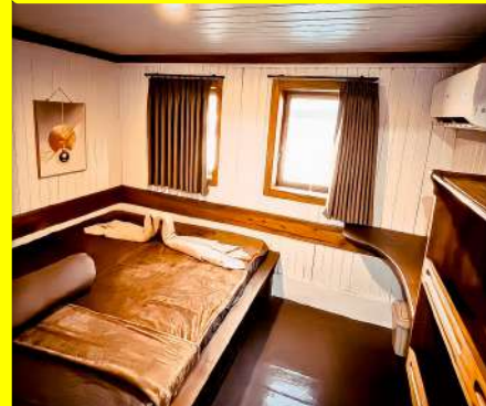
DELUXE CABIN SEA VIEW