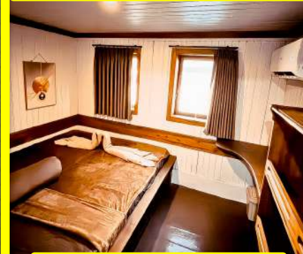
DELUXE CABIN SEA VIEW