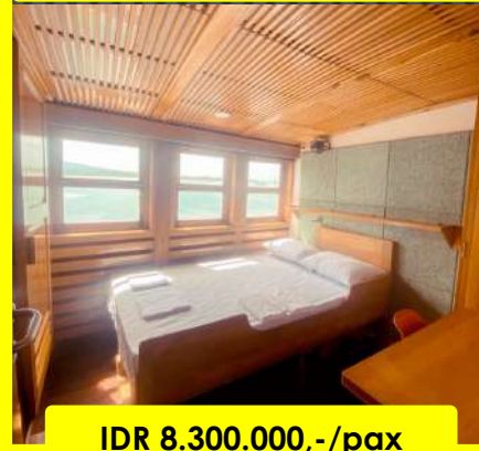
GRAND DELUXE CABIN