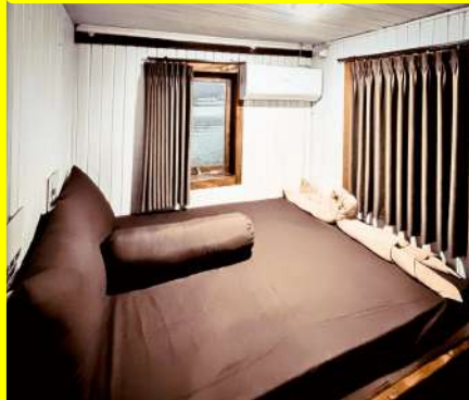
STANDART CABIN SEA VIEW