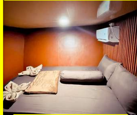
PRIVATE CABIN DOWN DECK