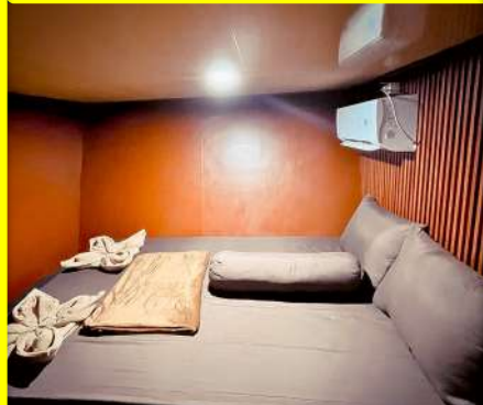
PRIVATE CABIN DOWN DECK