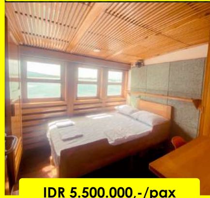
GRAND DELUXE CABIN