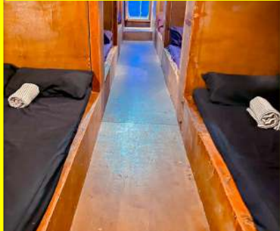
SHARED CABIN CLASS