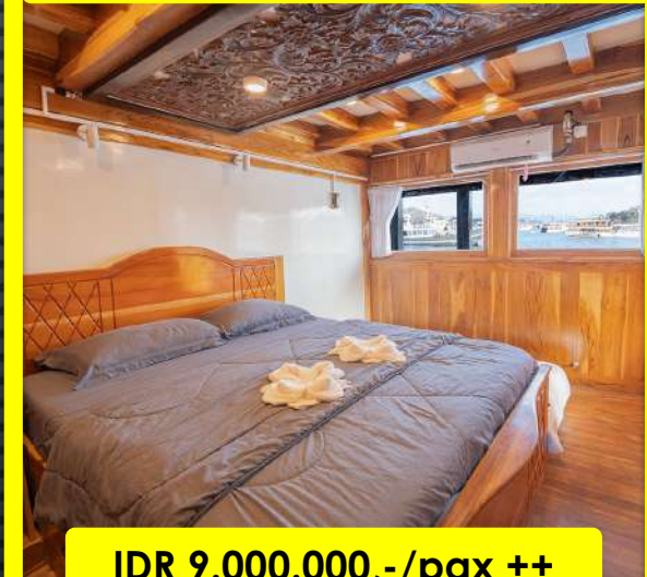
PRIVATE CABIN SEA VIEW