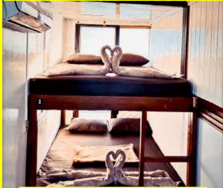
BUNK BED CABIN

LOMBOK to FLORES 4D3N : DEPART EVERY SATURDAY Check in time 07.00 am (Free Shuttle from : Gili, Bangsal, Mataram, Kuta)