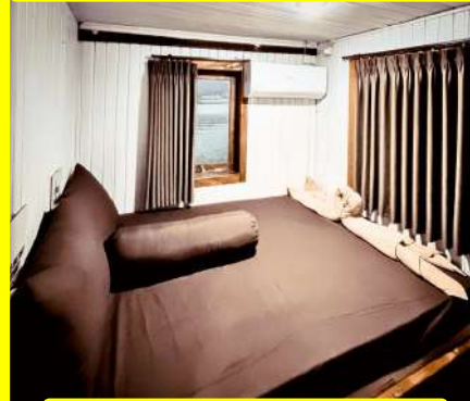
STANDART CABIN SEA VIEW