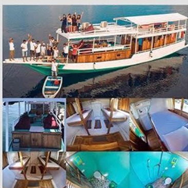
Kapal AC Standar kapasitas maks 14 Orang