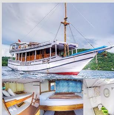
Kapal AC Standar kapasitas maks 12 Orang