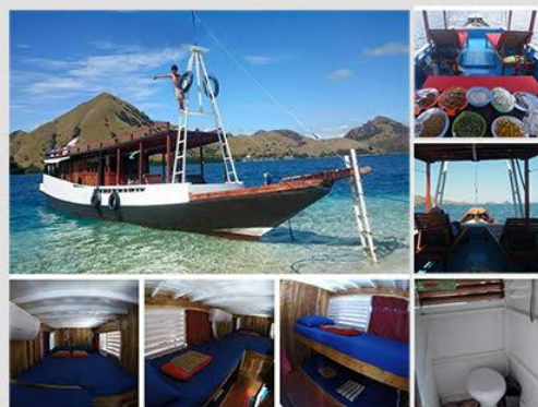
Kapal AC Standar Kapasitas Maks 8 Orang