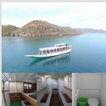
Kapal AC Standar Kapasitas Maks 8 Orang